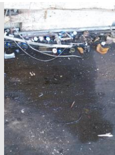
Oil on Asphalt

A 100% organic fiber sorbents with special features and quality • Easily and universally applicable! • On the water and on land • (sinks in water not from) • Pure natural (peat) • No hazard class! Non-toxic! • Absorbency 40-50 l / 7 kg • Application: in all areas such as Oil-Overcoming, transportation, agriculture, forestry and fire services, industry