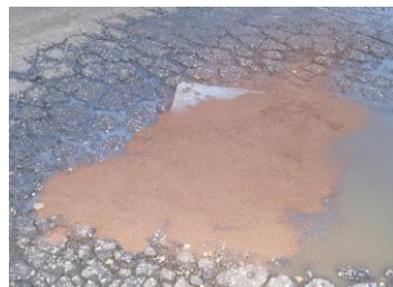
100 % Organic Fibre Oil